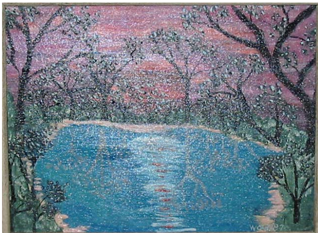
Sunset at Macochee