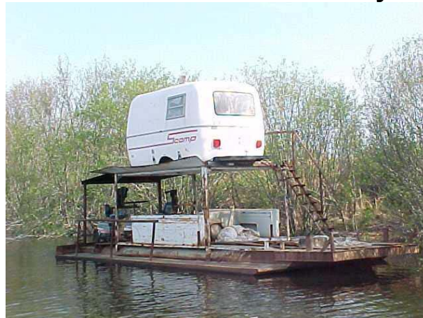
in Love Nest