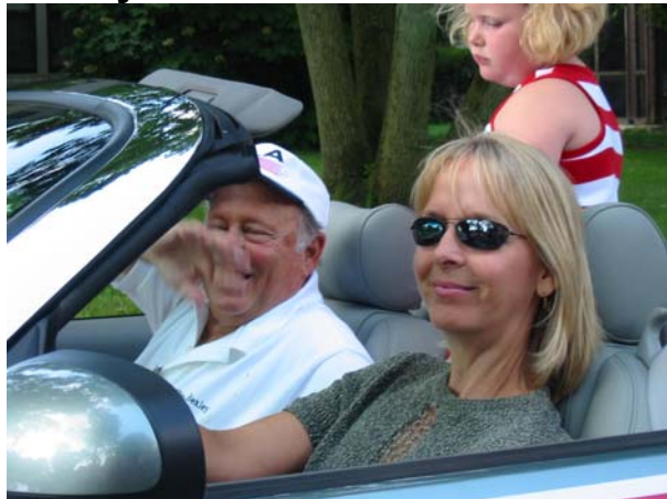
Mayor Sighted with Classy Blond

Mayor Blackballed after Secretary's bottom becomes Prez's Priority